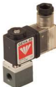
GEM-SOL® | CS-22 (G80-CS) Isolated 1/8", 2 Way, NC, NO