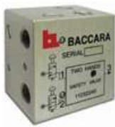
Two hand safety 1/8"