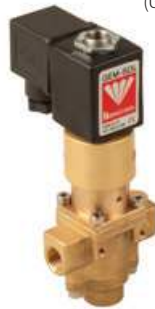
GEM-SOL® | SE-32 Pilot operated general purpose (GEM-SE) 1/4", 1/2", 3 Way