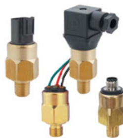
Series: XTC / STC / PTC /VTC /JTC