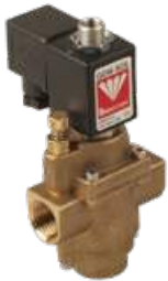
GEM-SOL® | S-32 Pilot operated 3 way (GEM-S) 1/4", 1/2", NC, NO