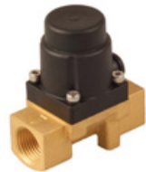
GC | 1/4"-1", 2 Way, NC, globe