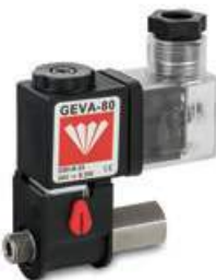
GEM-SOL® | BNJ-22 Direct acting (G80-BNJ) 1/8", BSP, 3 Way, NC, NO