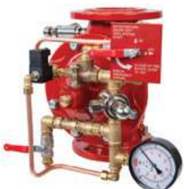
77DE-EL-MR | Ø100-4" Electrically Actuated Deluge Valve With Manual (Local) Reset-Aluminum