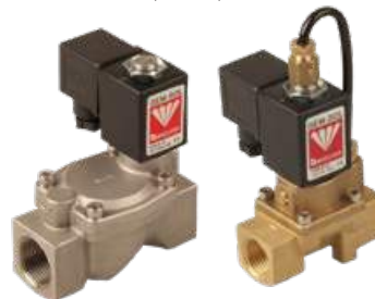
GEM-SOL® | S-32 Pilot operated 2 way (GEM-S) "1/4-1", NC, NO