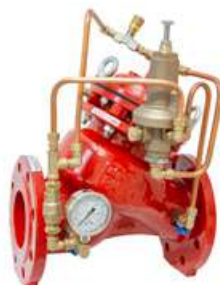
87UL-QR | Ø80-3" Fire Pump Relief Valve-Aluminum