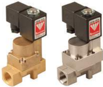
GEM-SOL® | HP-32 High pressure (GEM-HP) 1/4", 1/2", 2 Way, NC, NO