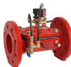
TD | Ø25-1" Test&Drain Valve-W/Sightglass-BSP-300 PSI-Brass-UL Listed-5.6K