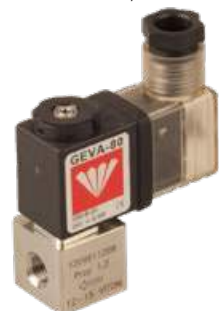
GEM-SOL® | PR-22 (G80-PR) Proportional M5, 1/8", 2 Way, NC