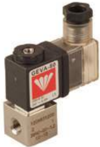
GEM-SOL® | A-22 Direct acting (G80-A) M5, 1/8", 2 Way, 3 Way, NC, NO