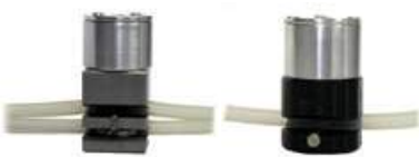
GC-P | Pinch 2 Way, 3 Way