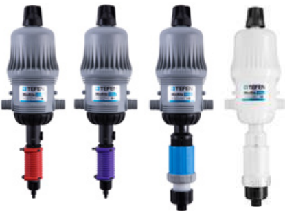
TEFEN Dosing Pump | For Poultry & Water treatment application