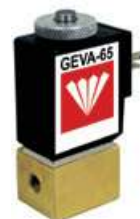
GEM-SOL® | A-16 Direct acting (G65-A) M5, 1/8", 2way, 3way, NC, NO