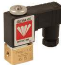
GEM-SOL® | PR-16 M5, 1/8", 2way, NC (G65-PR) Proportional