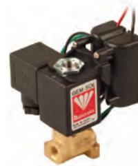
Assembled with A32 (GEM-A) solenoid