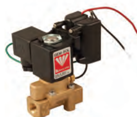
Assembled with S32 (GEM-S) solenoid