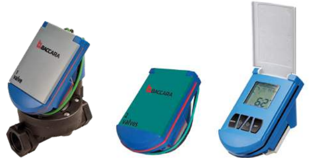
G75 One Valve